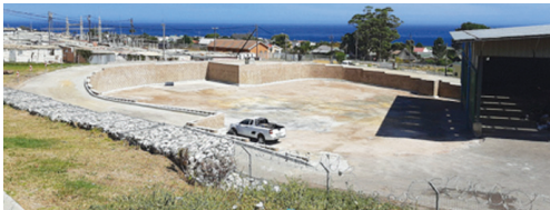
The transfer station's new cladding

As is evident from the picture below, the repaired garden waste drop-off area at Kleinmond's transfer station now sports a concrete retaining wall structure and a reshaped floor area.